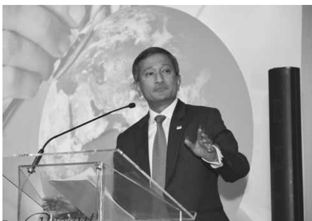
Guest of honour for the evening, Minister Dr Vivian Balakrishnan's topic was "Medicine in a Globalised World"