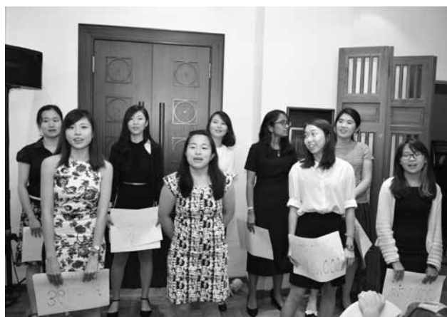
1 st year residents presented an item for the evening