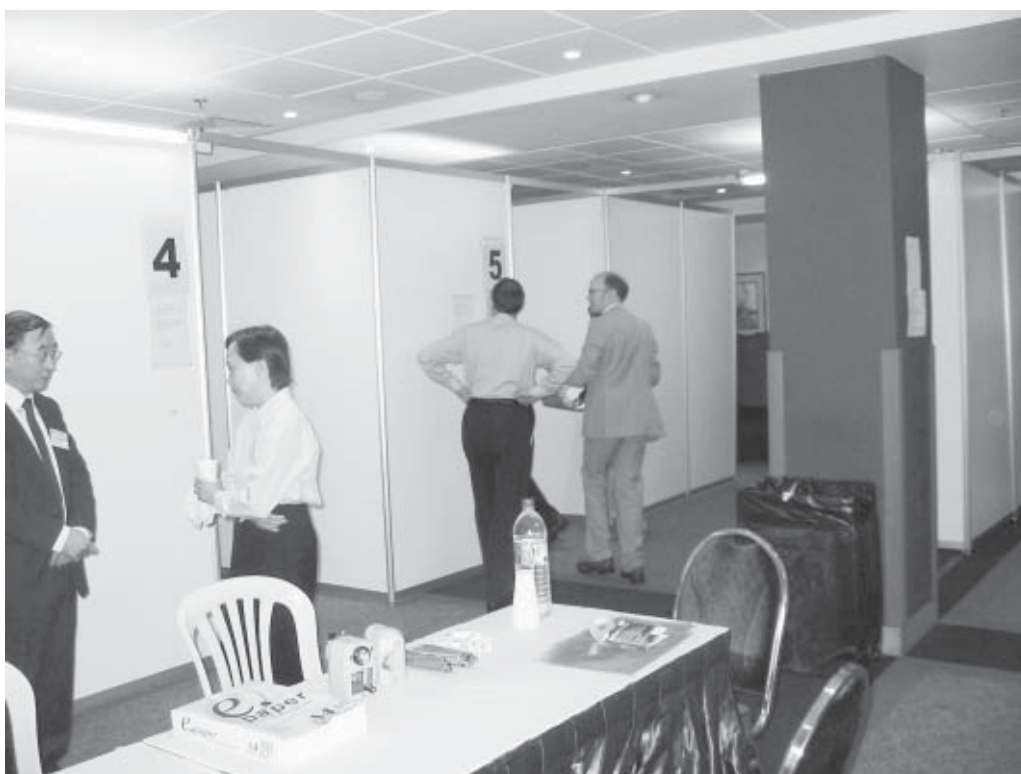
The Oral Assessment panel stations