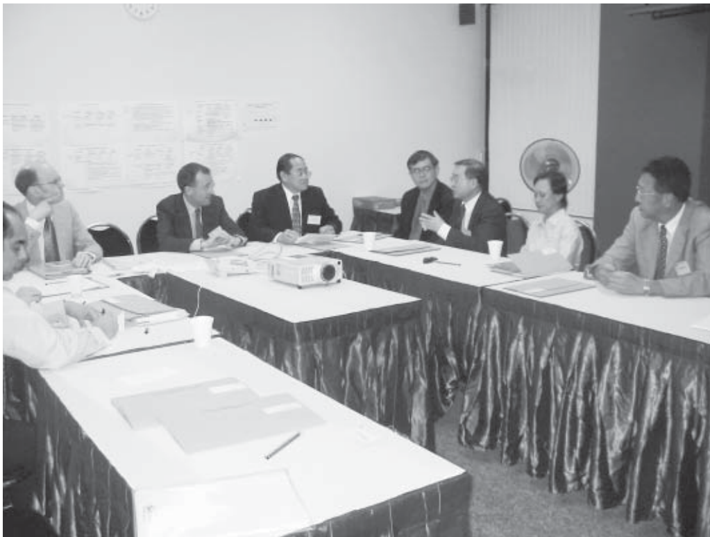
Examiners' Meeting prior to the Oral Assessment examination